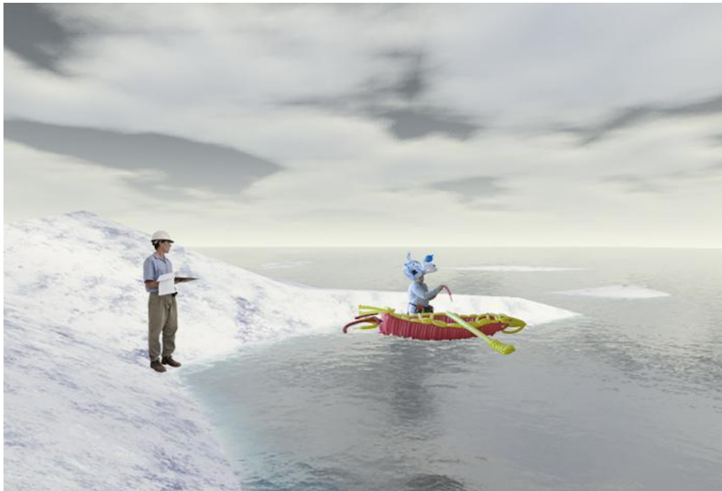
© Jane Marsching, Arctic Then Serie