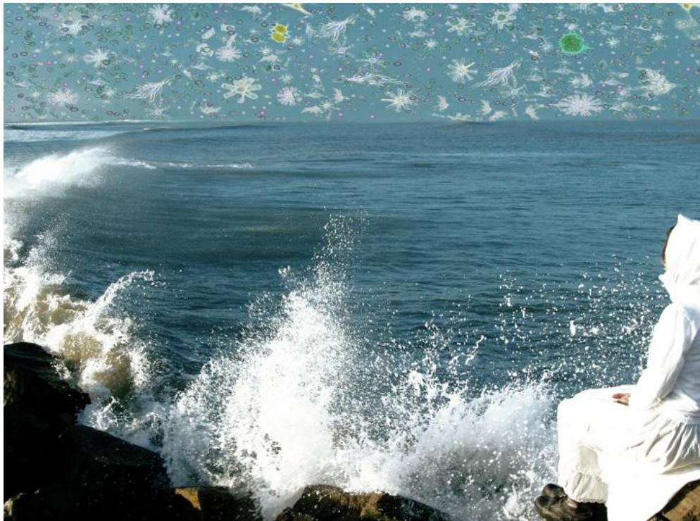
The Invisible Forest IV, Serie, Patagonia 2008