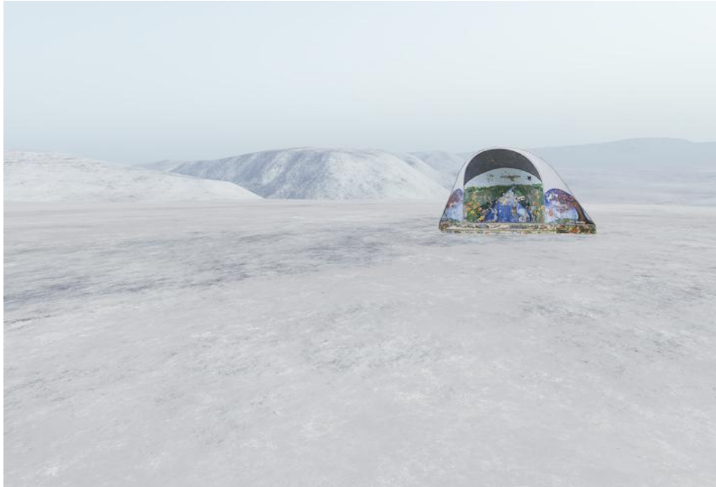
Arctic Then Serie

“Arte, Ciencia y Naturaleza en Conexión”