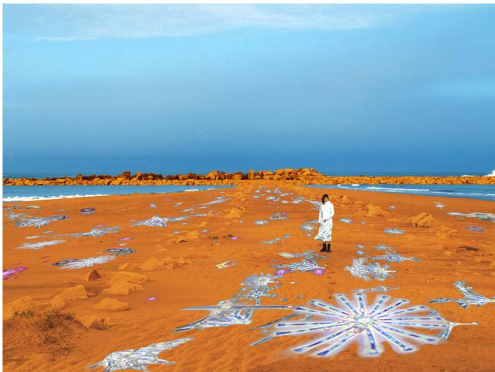
© Andrea Juan, The Invisible Forest II, Serie - Patagonia 2008

In the ocean, the invisible forest marine phytoplankton plays a critical role in regulating Earth's climate. Can it be used to combat global warming? Every drop of water within 100 meters of the ocean contains thousands of free-floating microscopic plants called phytoplankton. Explore how human activities can alter the impact of phytoplankton in the carbon cycle on the planet, is crucial for predicting long-term ecological effects. The photo shots were made at the Argentine Sea, Patagonia Section. The exhibition features video installations, sculptures, digital art and photography