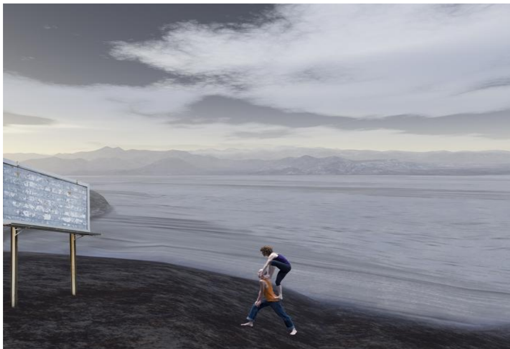
© Jane Marsching, Arctic Then Serie

It translates digital elevation models of glaciers in the Arctic Circle developed by scientists in a program for interpretation of 3D virtual landscapes that incorporate meteorological model and approximate temperature sensitivity. Each glacier is the focus of research for glaciologists; they seek to understand the response of the alarming acceleration of Arctic glaciers to climate change. Thinking about the light, approaching stormy weather, melting glaciers corrupt the land with a sublime uncertain atmosphere.