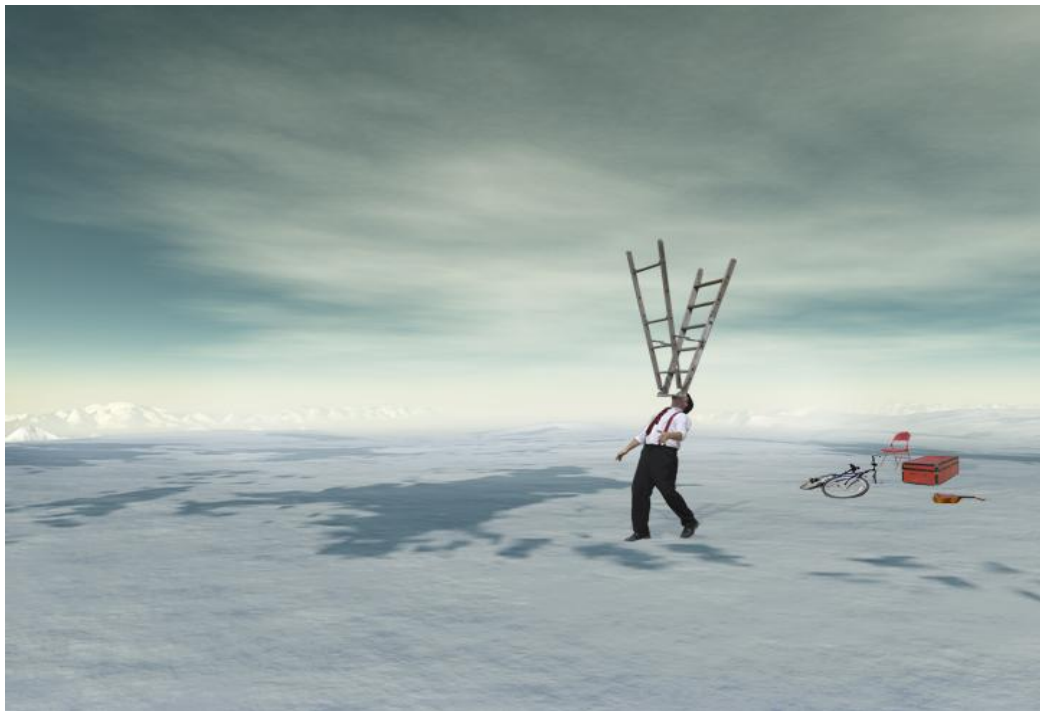
© Jane Marsching, Arctic Then Serie